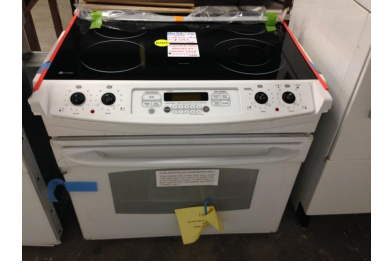
GE Drop-In Oven - $499