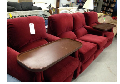
Burgundy Home Theater Seats - $1,500 <u>Check here</u>