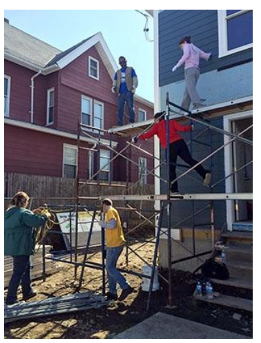
Andrew College students at work

All of the groups seem to have a great time volunteering with Habitat CFC! The students from Andrew College in Georgia created a collective journal of their recent adventures on their Collegiate Challenge in Bridgeport and