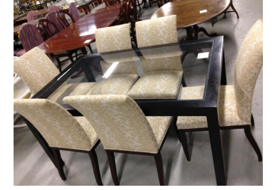
Espresso Glass Top Table & 6 Chairs - $599 Check here