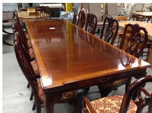
Ethan Allen Table with 12 chairs