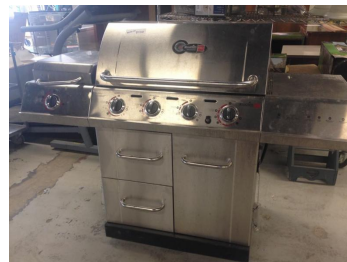
Char-Broil Gourmet Grill