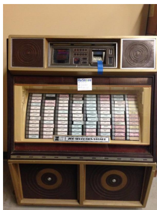
Jukebox with a key in working condition