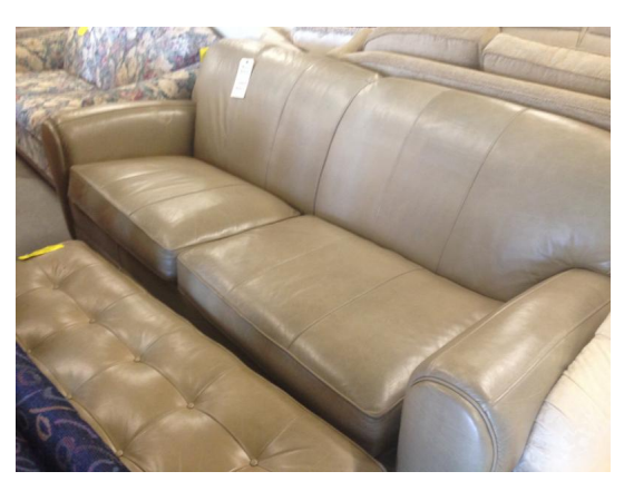
Cream Leather Couch with Ottoman - $599