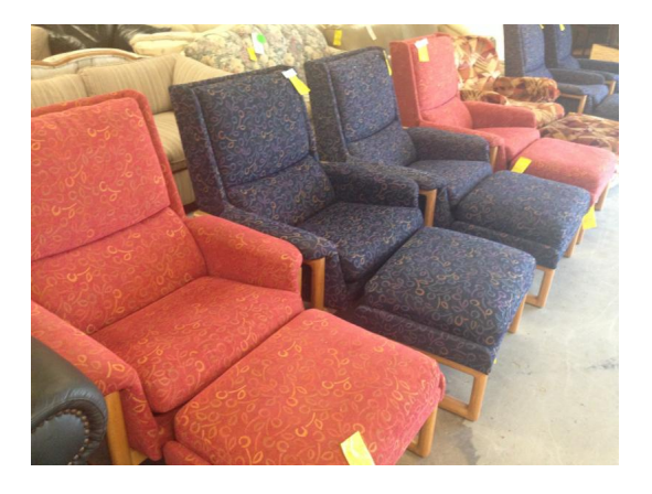
Hotel style armchair with footstool in red or navy -$45/each